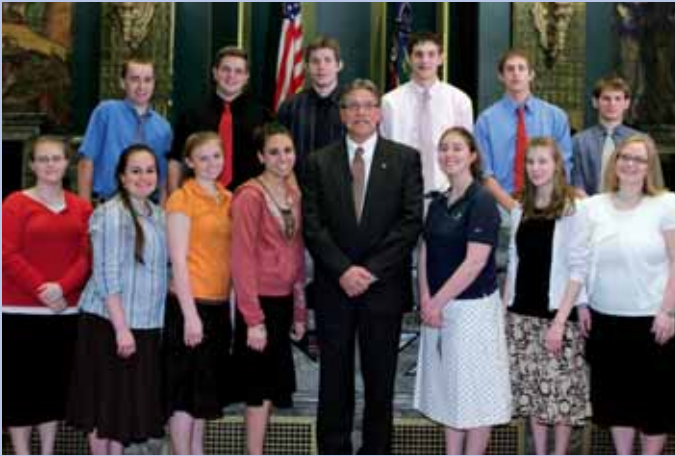
Several senior government class students and their teacher from Red Lion Christian School ventured to the Capitol for a hands-on lesson in State Government.

Senate Bill 1158 is currently before the House Transportation Committee awaiting consideration.