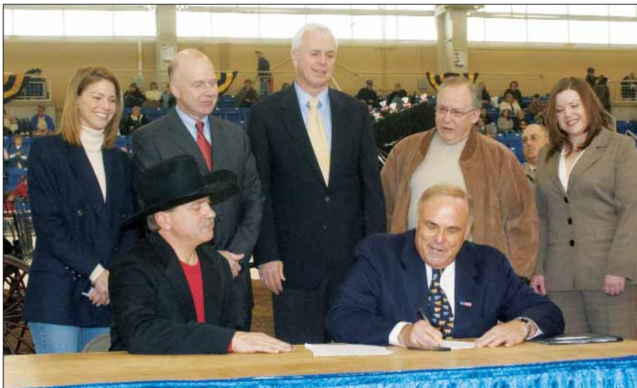
At the Farm Show, Sen. Waugh looks on as Governor Rendell signs Senate Bill 618, legislation Sen. Waugh sponsored to protect the state's equine industry.

Thirty states have spending controls and/or revenue controls to protect their taxpayers. Pennsylvania is in the minority of states which have no such taxpayer protections, but I am confident that we can see these two bills signed into law in the near future to ensure greater fiscal responsibility in state government.